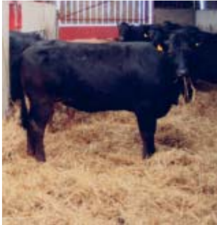
Cattle preferred straw to other floor types examined

This project examined the preferred choice of animals for a particular floor type when offered a choice of lying areas. The floor types tested were slats, slats covered with rubber mats, slats covered with rubber strips, sawdust and straw.