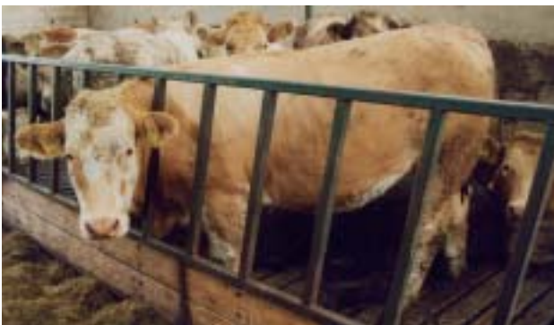
Cattle on slats performed as well as those housed on other floor types

b 5 point scale: 1 = leanest, 5 = fattest