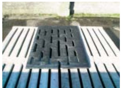
Perforated rubber mats over the slatted area

Cattle were accommodated at space allowances of 3.0 m 2 /animal on the slatted floors and a higher space allowance of 5.3 m 2 /animal on the straw-bedded floors.