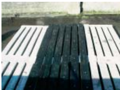
Rubber strips secured to concrete