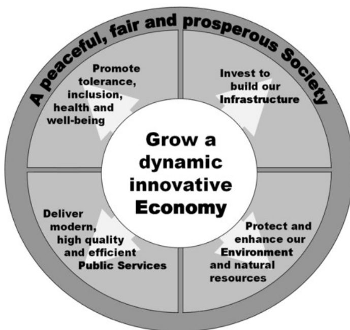
Fig. 1: Programme for Government Framework

The Programme for Government cross-cutting themes of a better future and sustainability are embedded within the Investment Strategy. Future investment must be made wisely, and by working together in the Executive and in wider society we can all contribute to a better future that is reflected in, and supported by, new patterns of infrastructure development that offer equality of opportunity for all. Sustainability is also a key to ensuring long term