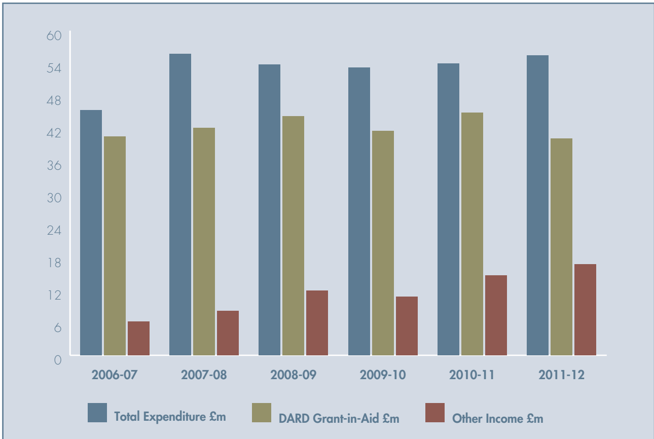
Figure 2: Breakdown of AFBI Expenditure and funding (2006-07 to 2011-12)