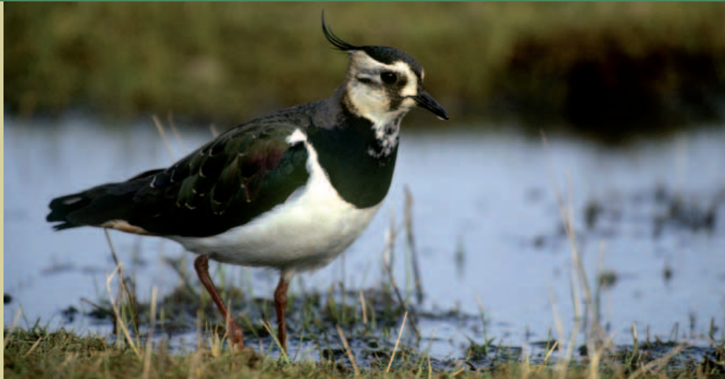
Lapwing, ©RSPB Images

Individual payment rates have been reviewed and generally increased for those entering NICMS, to reflect the increased costs and reduced outputs for participants.