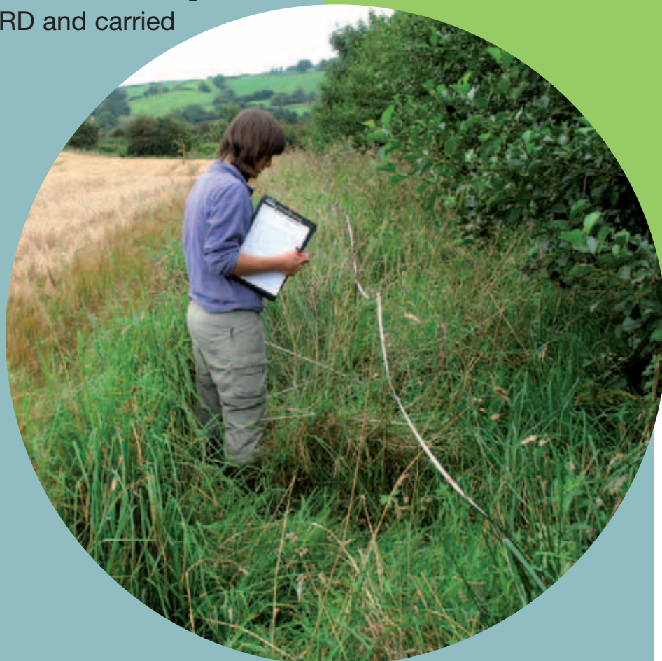
Agri-environment Monitoring Unit carrying out a survey of a rough grass field margin in CMS.

Baseline monitoring of habitats and options in CMS was carried out in 2002/03 and results of a recent re-survey are currently being analysed. Results suggest that habitats have not changed significantly