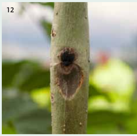
Older lesion associated with leaf scar.