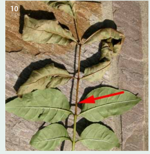
Necrosis of rachis (arrowed) and associated desiccation of leaflets.