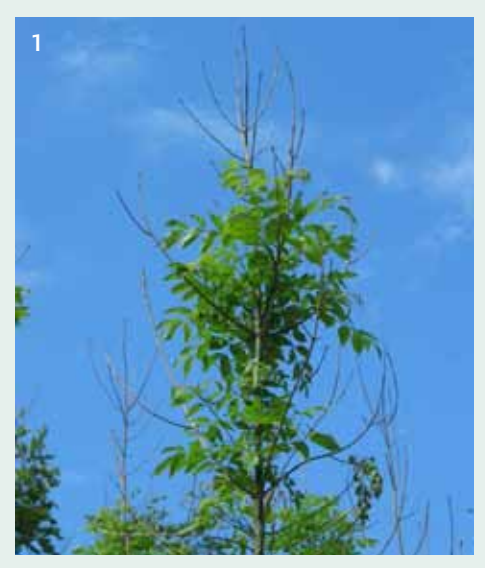
Diseased saplings typically display dead tops and/or side shoots.