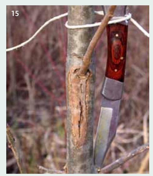
Old lesion centred on a dead side shoot.