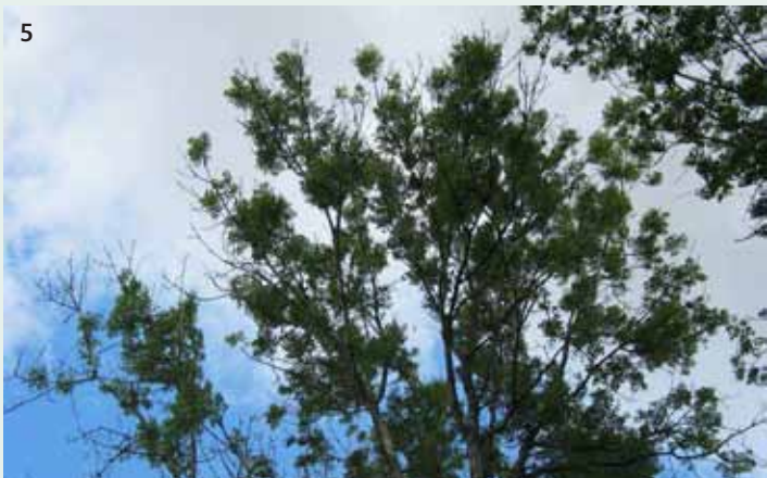
Mature trees affected by the disease initially display dieback of the shoots and twigs at the periphery of their crowns. Dense clumps of foliage may be seen further back on branches where recovery shoots are produced.