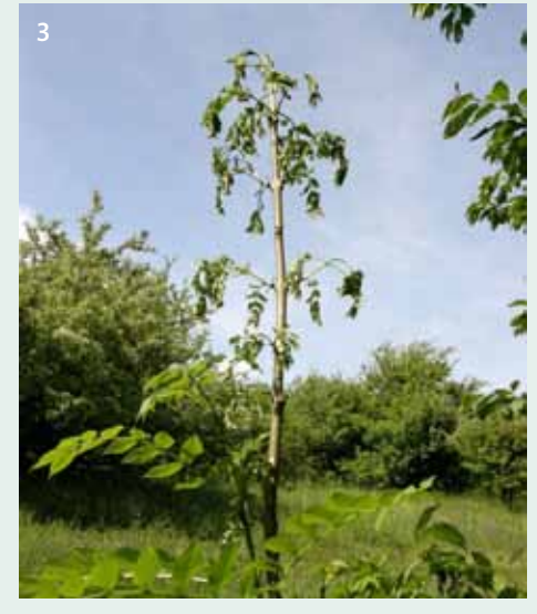
Lesions which girdle the branch or stem can cause wilting of the foliage above.