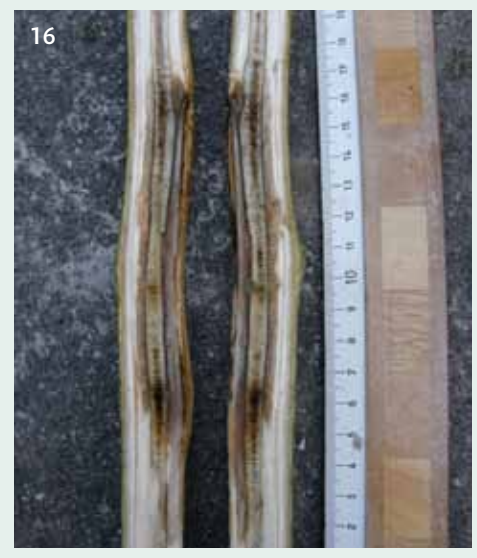
The wood and pith underlying bark lesions is usually strongly stained.