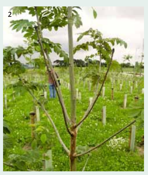
At the base of dead side shoots, lesions can often be found on the subtending branch or stem.