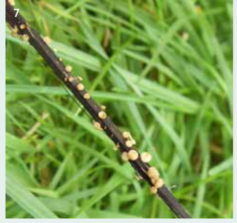
In late summer and early autumn (July to October), fruiting bodies of Hymenoscyphus can be found on blackened rachises (leaf stalks) of ash in damp areas of leaf litter beneath trees. These do not necessarily belong to the pathogen but can be tested to determine their identity.