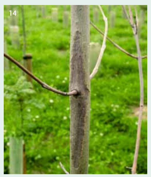
Older lesion centred on a dead side shoot.