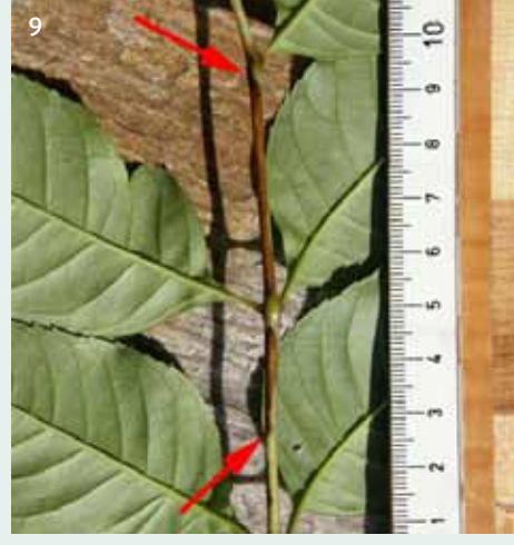
Lesion on rachis (ends arrowed) without leaflet symptoms.

Developing lesions associated with leaf scars.