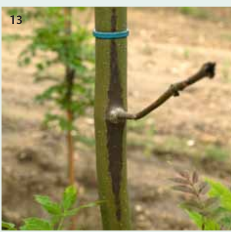
Developing lesion centred on a dead side shoot.