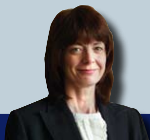
Guider o Baste Poust an Weelfarity Roadin Colette McMaistèr