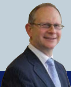
Guider o Lanwart Sillerin Twinin Andra Ellit

'Tha Shaidin is tae tha fore furtae graith an ootpit fairm yird-hainin pratticks an ingangs 'at'll fair thair surroons. Forbye, furtae mak siccar o complutherin it leuks ower lan tae see whuther it's shuitin, an effeirin maittèrs, thegither wi sichtin kye fur kennin adae wi tha Sing'l Fairm Sillerin, No Sae Able Airt Mends Allooance an Fairm yird-hainin pratticks. Forbye, it haes tha ontak o makkin siccar 'at tha Lan Paircel Kennin Gate (LPKG) shuits tha stannèrts o CE.'