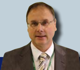
Guider o Enzootic Disase an Baste Weelfarity Coalin Hairt

‘Tha Twinin is tae tha fore furtae aise vit wisin tae Roadin an ootpit vit ontaks fur tha hannlin furtae kep epizootic disases an redden up kin o bastes fur flesh-mait; wi mintin fur dootsum ill-daeins in tha oncum, tha Twinin maks siccar o bein graithit fur onie epizootic disase tha like o thon in Norlin Airlan, an ootpits fur tha hannlin owerance adae wi flesh-mate hygiene an sichtin fur tha pairt o tha Mate Stannèrts Agentrie’.