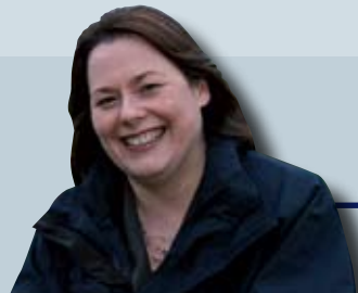
Männystèr Michelle Gildernew MP MLA