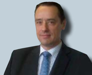
Seekitar (Roadin) Depute Doc Maik Broom