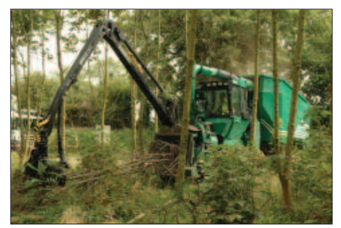
Figure 3: The Silvatec chipper is a purpose-built machine including a chipper and a collection container.

The purpose-built machine consists of a chipper integrated with the base machine carrier, which also includes a container to hold the chips (Figure 3). Usually this machine works in tandem with a chip forwarder that backs up to the chipper in the stand and receives the load, which the chipper tips into its bin. The chips are then forwarded to the roadside for unloading, either into a road transport vehicle or as a pile. The advantage of this system is that the chipper can continue chipping and does not have to spend time transporting the chips to the roadside before returning to the forest for another load. The chipper and