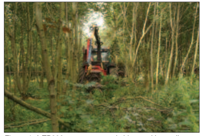
Figure 4: A TP280 tractor-mounted chipper with a trailer attached to collect the chips.